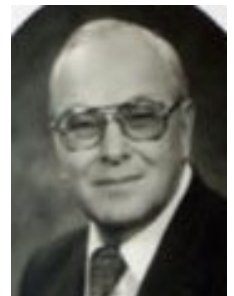
Electromotive Industrial Engineer