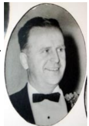
Real Estate And Insurance Broker