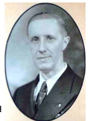
Chicago, Burlington & Quincy Railroad