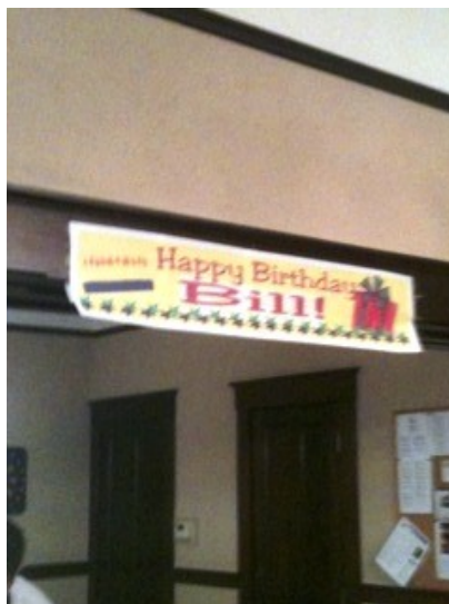
Birthday Sign in Dining Room