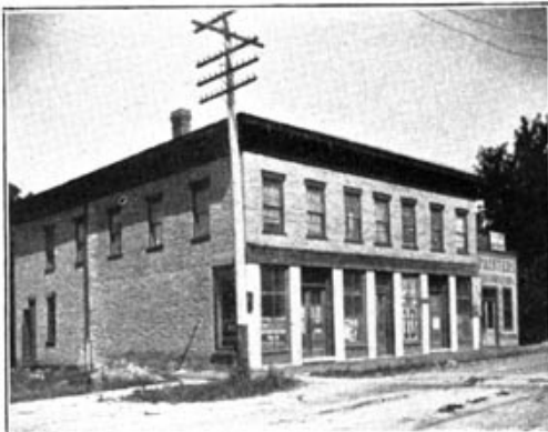
LODGE HALL 1865-1868