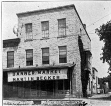
LODGE HALL 1852-1857

IN THE FRAME BUILDING EUCLID LODGE WAS ORGANIZED