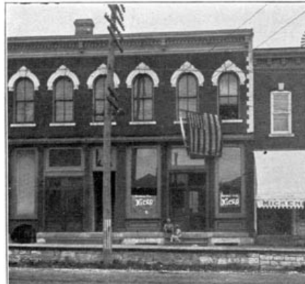
LODGE HALL 1868-1891