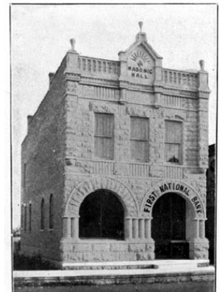
MASONIC HALL EUCLID'S PRESENT HOME