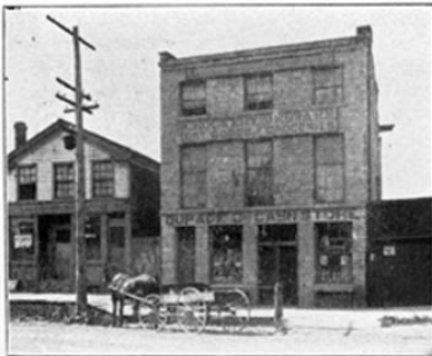
LODGE HALL 1849-1852

IN THE FRAME BUILDING EUCLID LODGE WAS ORGANIZED