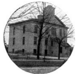
LODGE HALL, 1857-1865 ACADEMY